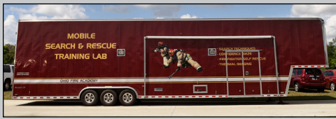
Mobile Search & Rescue Training Lab

The OFA Close to Home series brings training to students while offering the same expert instructors and the Academy's extensive range of apparatus, equipment and training simulators. To better manage time and resources, students can select from a range of courses taught at a location and time near them. Close to Home has three delivery types: