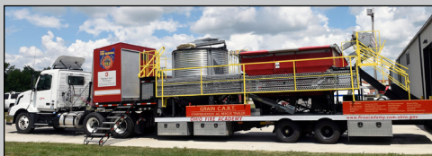
Grain Bin Trailer