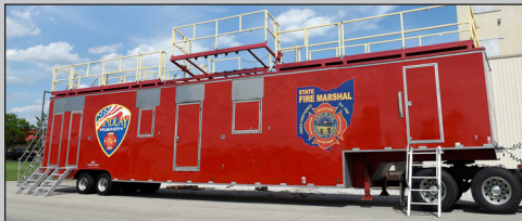
Fire Blast Trailer