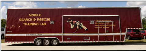
Mobile Search & Rescue Training Lab

The OFA Close to Home series brings training to students while offering the same expert instructors and the Academy's extensive range of apparatus, equipment and training simulators. To better manage time and resources, students can select from a range of courses taught at a location and time near them. Close to Home has three delivery types: