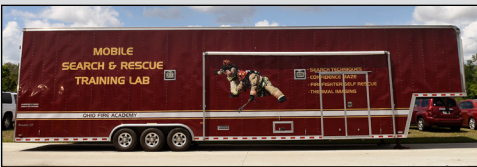
Mobile Search & Rescue Training Lab

The OFA Close to Home series brings training to students while offering the same expert instructors and the Academy's extensive range of apparatus, equipment and training simulators. To better manage time and resources, students can select from a range of courses taught at a location and time near them. Close to Home has three delivery types: