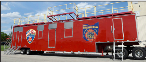
Fire Blast Trailer