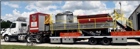
Grain Bin Trailer