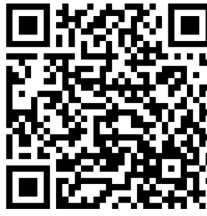
Register for a Course

More info at: mha.ohio.gov/Schools-and-Communities/First-Responders