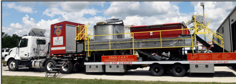
Grain Bin Trailer