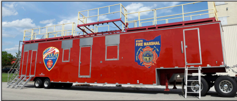
Fire Blast Trailer