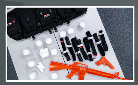
Instructor Training Kit