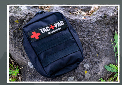
Emergency TAC PAC Kit