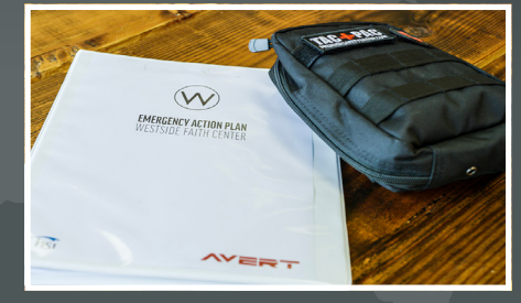
Emergency Action Plan Template