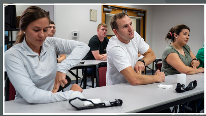
Bleeding Control Practice

GO BEYOND ACTIVE SHOOTER RESPONSE TRAINING