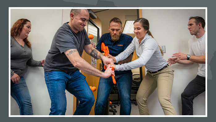
Active Violence Response Training

Unlike other training programs that focus solely on Run, Hide, Fight techniques. AVERT uses an active training method to teach awareness, how to react in a violent situation, and how to respond to severe bleeding injuries that are often a result of these occurrences.